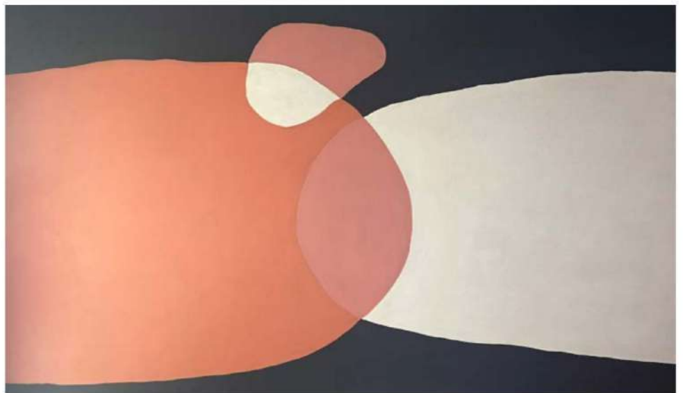
I Sit and Wait acrylic gouache on canvas 48" x 84"