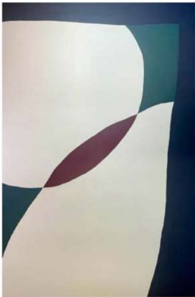
Are We Human? acrylic gouache on canvas 72" x 48"