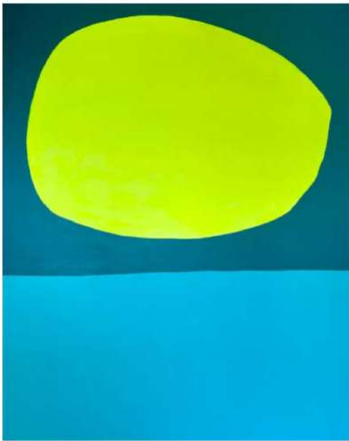
Ode to Ellsworth acrylic gouache on canvas 60" x 48"

DeBell, residing in Ontario, Canada, has exhibited widely at notable venues, including the Art Gallery of Hamilton (Hamilton, ON); The Artist Project (Toronto, ON); The Other Art Fair (Brooklyn, NY); Collective 131 (Toronto, ON), KW (Toronto, ON); Noodle Gallery (Toronto, ON); Paula White Diamond Gallery (Waterloo, ON); The Art Gallery of Burlington (Burlington, ON); Signet Contemporary Art (London, UK); and 100 Kellogg Lane (London, ON), among others. DeBell is currently represented by Gallery 133 (Toronto, ON); Kefi Art Gallery (Toronto, ON); and White Galleon Gallery (Thorold, ON).