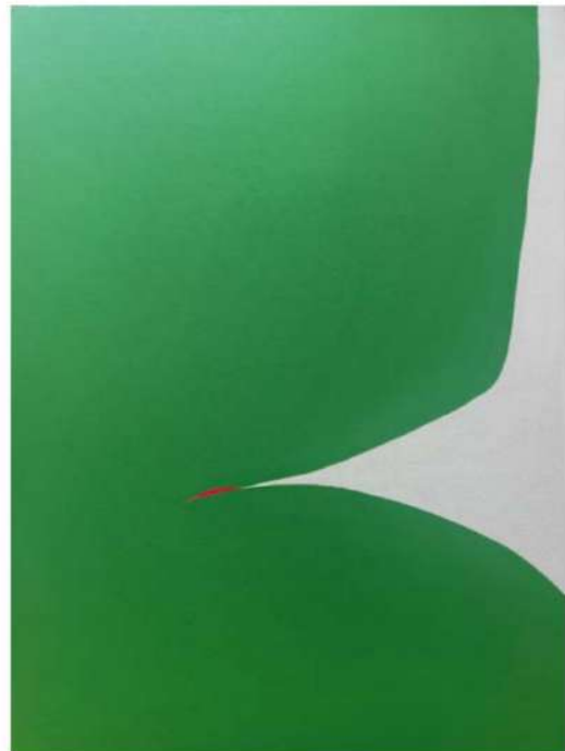
In the Presence of Beauty acrylic gouache on canvas 40" x 30"

DeBell, residing in Ontario, Canada, has exhibited widely at notable venues, including the Art Gallery of Hamilton (Hamilton, ON); The Artist Project (Toronto, ON); The Other Art Fair (Brooklyn, NY); Collective 131 (Toronto, ON), KW (Toronto, ON); Noodle Gallery (Toronto, ON); Paula White Diamond Gallery (Waterloo, ON); The Art Gallery of Burlington (Burlington, ON); Signet Contemporary Art (London, UK); and 100 Kellogg Lane (London, ON), among others. DeBell is currently represented by Gallery 133 (Toronto, ON); Kefi Art Gallery (Toronto, ON); and White Galleon Gallery (Thorold, ON).